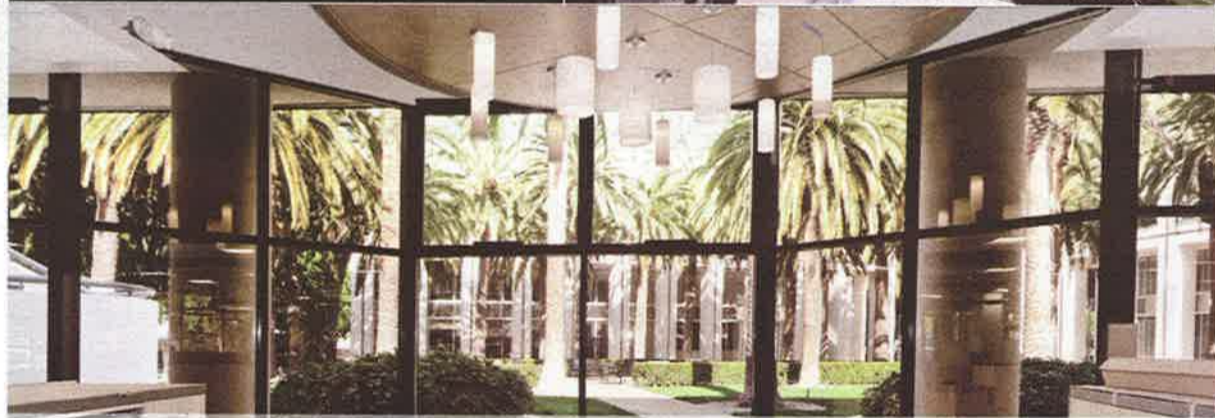
DPR's New Sustainable Regional Office

Assisting owners in developing and implementing the best strategies, DPR combines experienced people, a collaborative methodology and custom tools to help customers address the triple bottom line: environmental, social and economic.