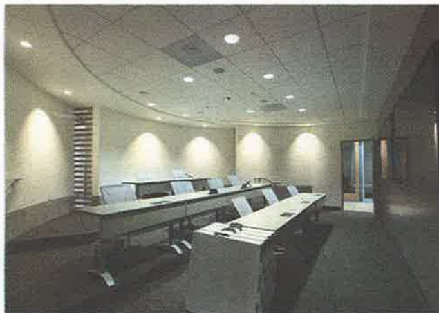
The office was built with high-sustainability standards, cutting-edge technology features and a focus on a collaborative working environment.

moting an open exchange of ideas and increased communication