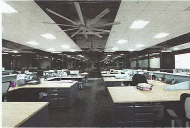
Open office environment with linear workstations and no separate offices or department separations promotes an open exchange of ideas and increased communication.