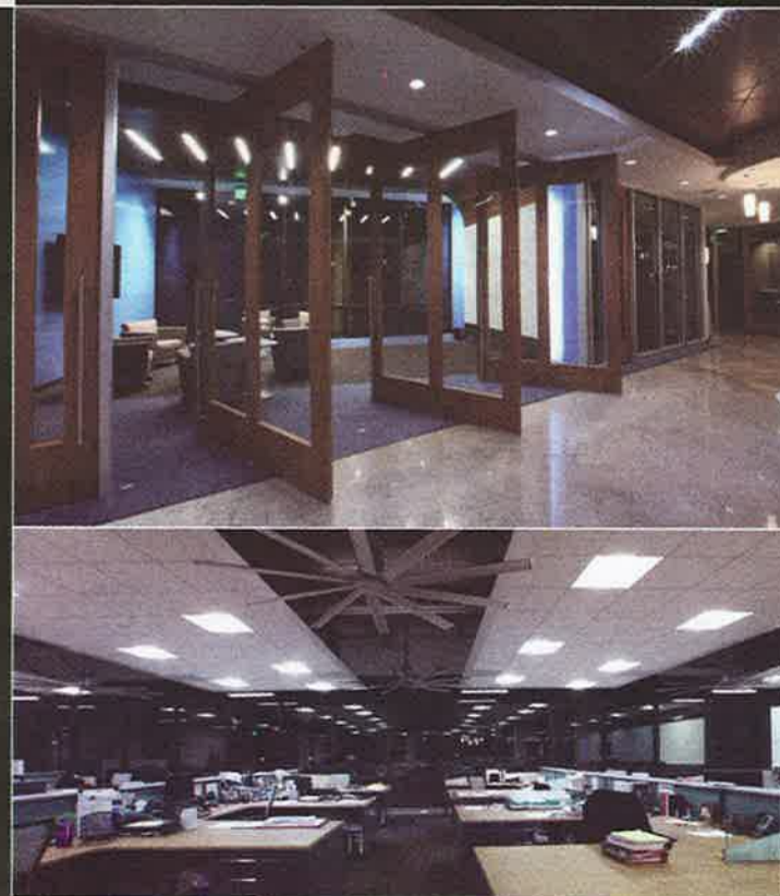
Targeting LEED Gold Certification