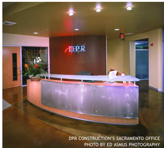
DPR CONSTRUCTION'S SACRAMENTO OFFICE

As an active member of USGBC since 1999 and with the largest percentage of LEED-accredited professionals (LEED APs) on staff of any general contractor in the nation, Redwood City, Calif.-based DPR Construction Inc. ( www.dprinc.com ) has been at the forefront of the green-building movement. The firm has worked on more than 30 green projects, and each one provided unique lessons about green building for general contractors and building owners.