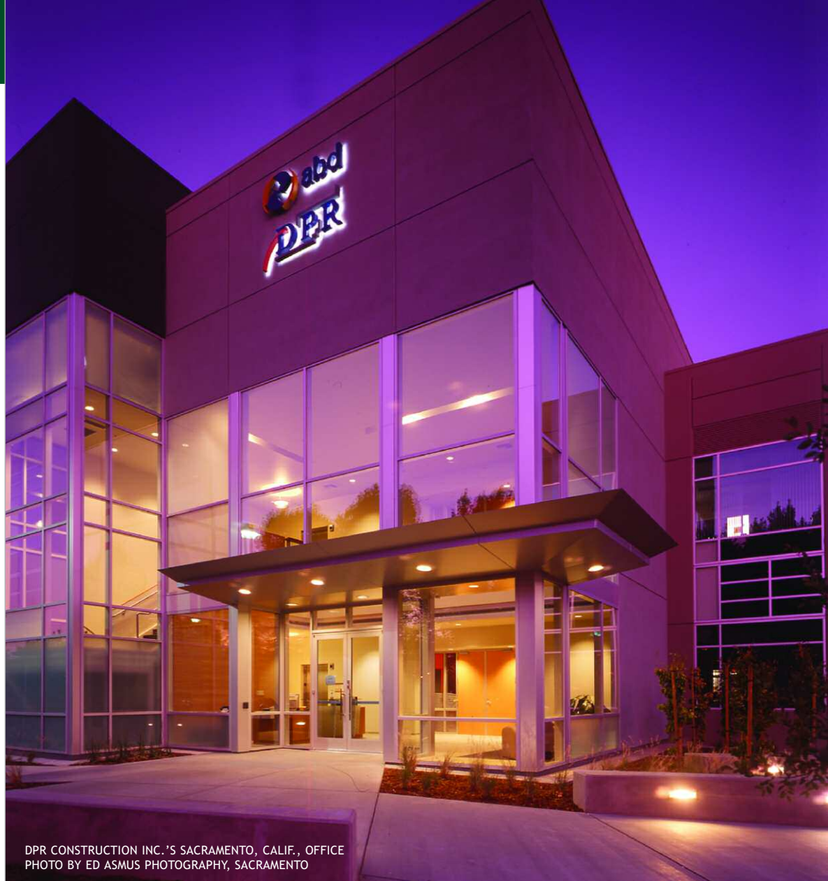
DPR CONSTRUCTION INC.'S SACRAMENTO, CALIF., OFFICE

A GENERAL CONTRACTING COMPANY LEARNS LESSONS ABOUT GREEN BUILDING