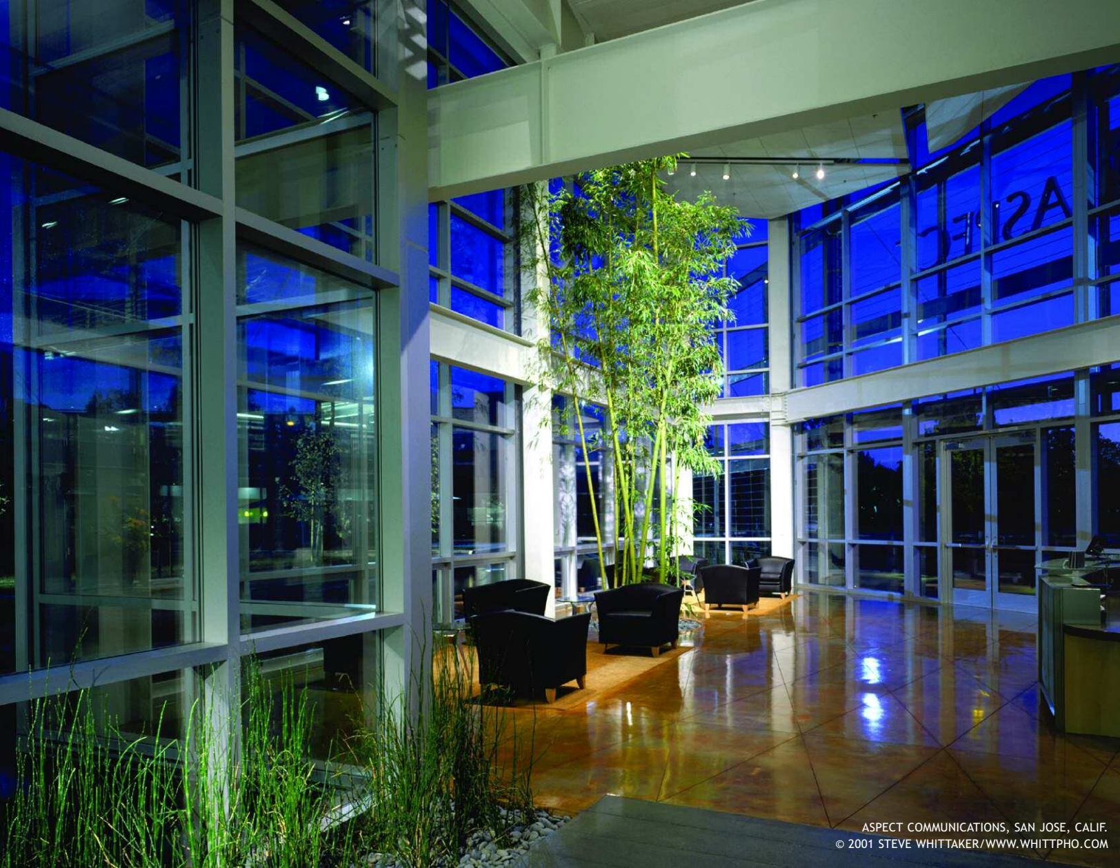
ASPECT COMMUNICATIONS, SAN JOSE, CALIF.