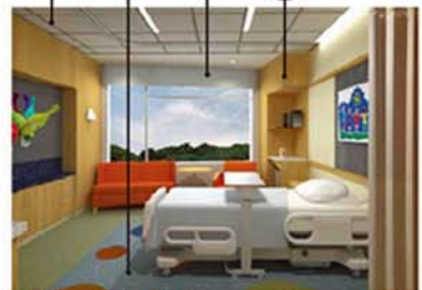
High Level Material Assessment Protocol